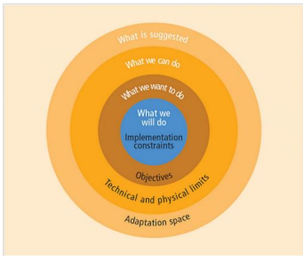
Figure 2: Only a small subset of all suggested adaptation measures will be implemented due to technical and physical limits as well as to differences in objectives.

The narrowing of adaptation: from what is needed to what will be implemented